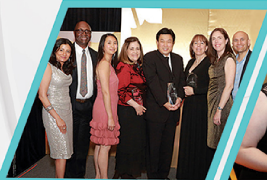
PG&E / Akraya, Inc.