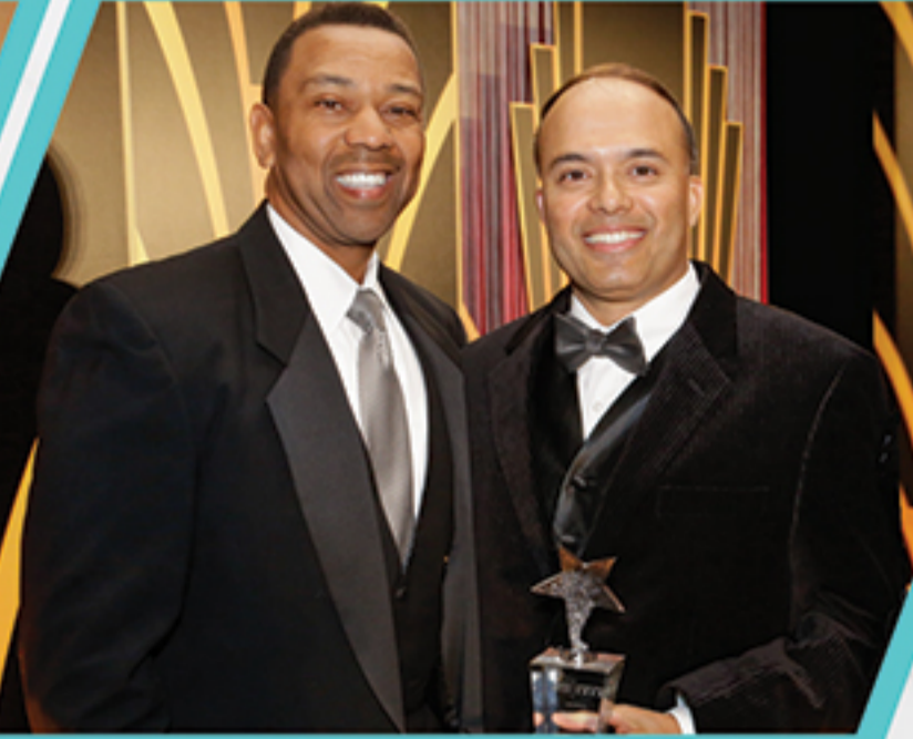
Cisco / Q Analysts, LLC