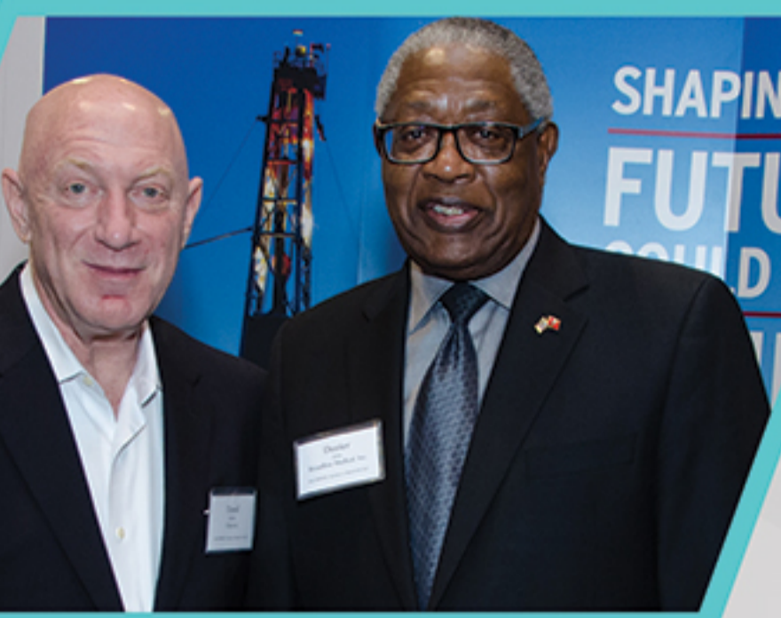
Chevron / Broadline Medical, Inc.