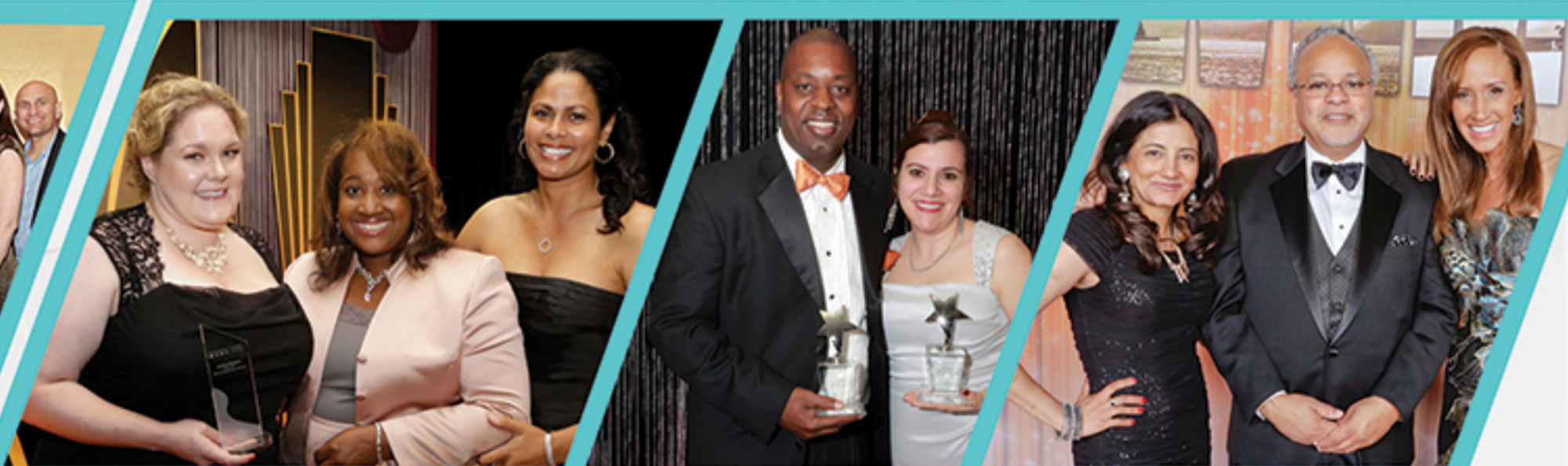
Robert Half / MGM Resorts Intl. / WRMSDC / WWT / Inproma, LLC / Akraya, Inc. / Customized Performance, Inc. / ICE Safety Solutions