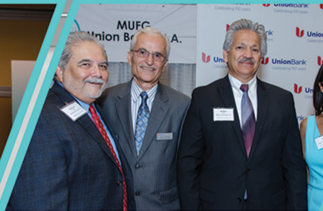
MUFG Union Bank, N.A.