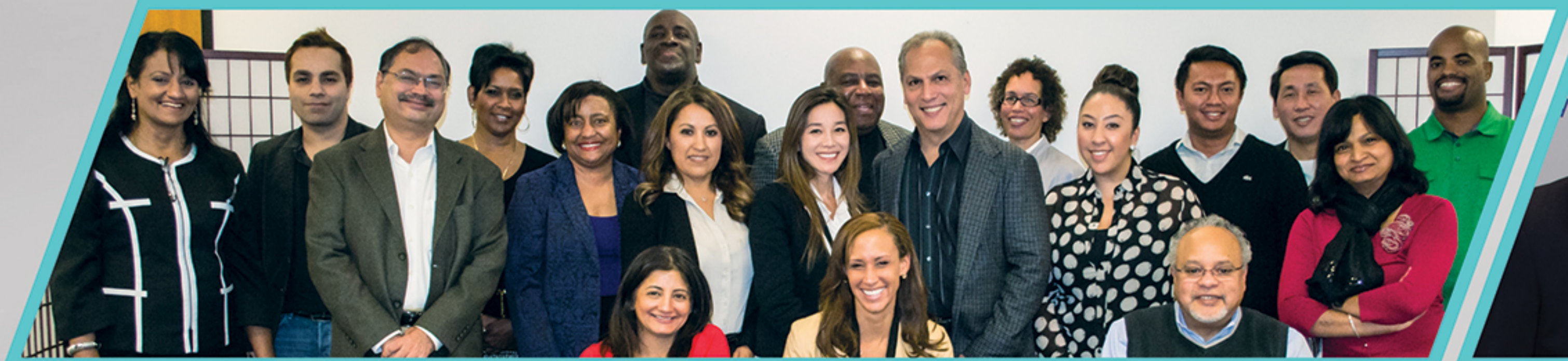
MBE Input Committee