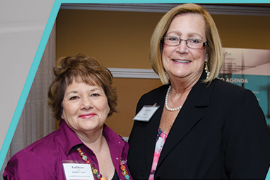
Robert Half / Brocade