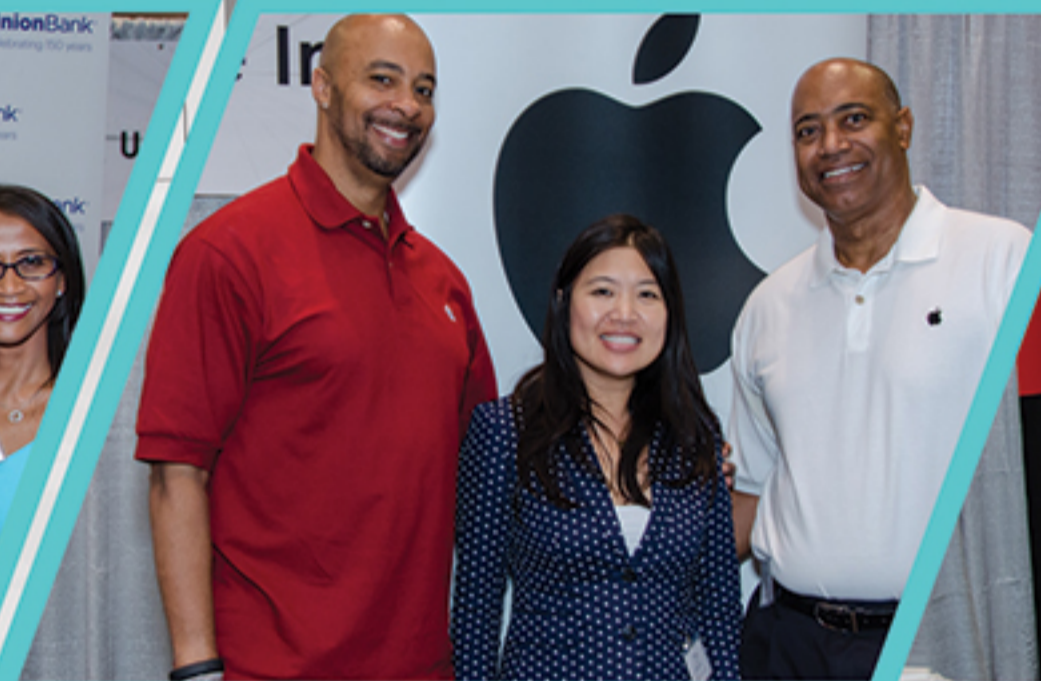
Apple Inc. / Wells Fargo