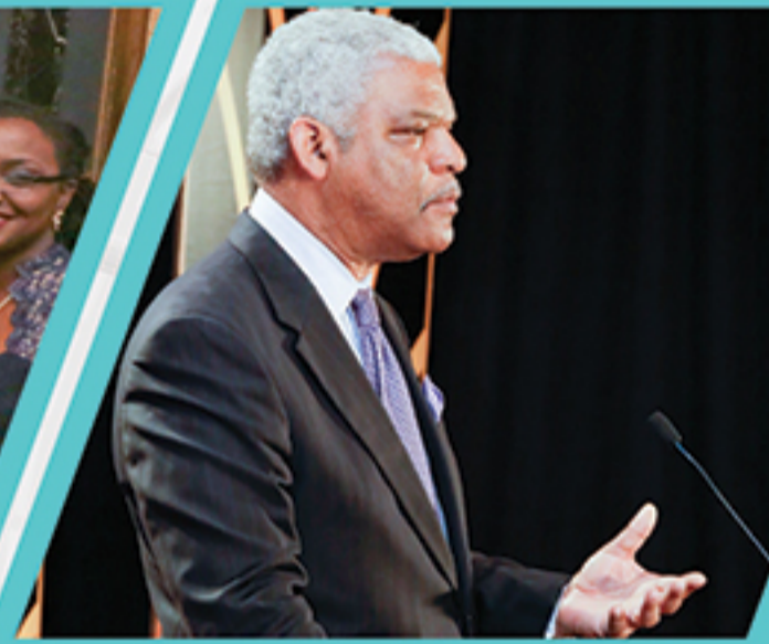
MUFG Union Bank, N.A.