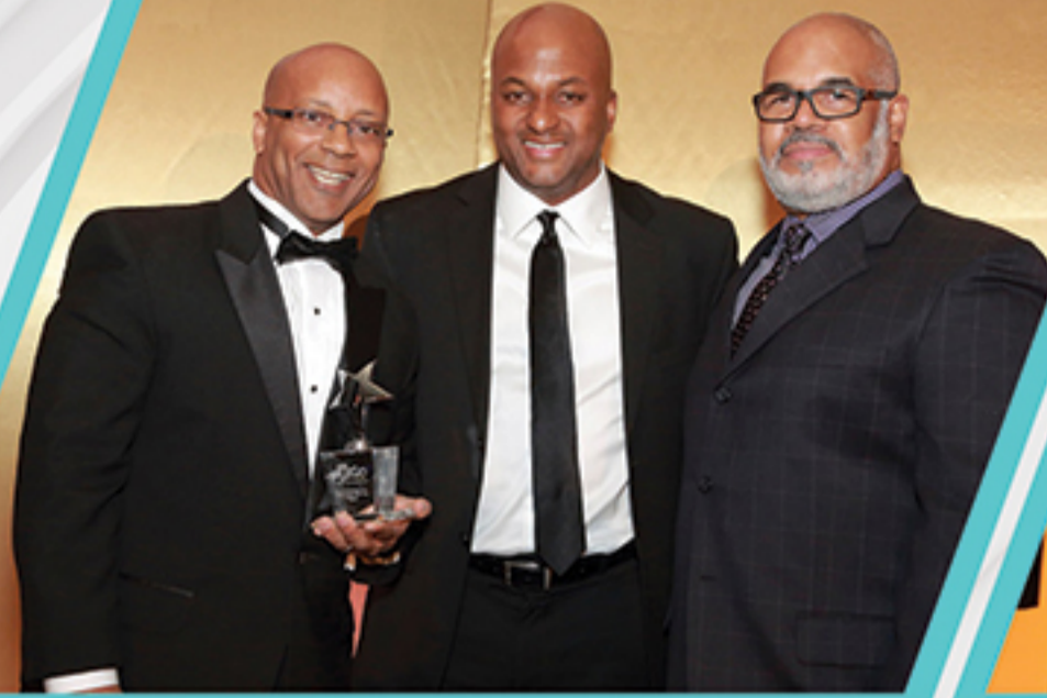
Way To Be Designs, LLC/HP